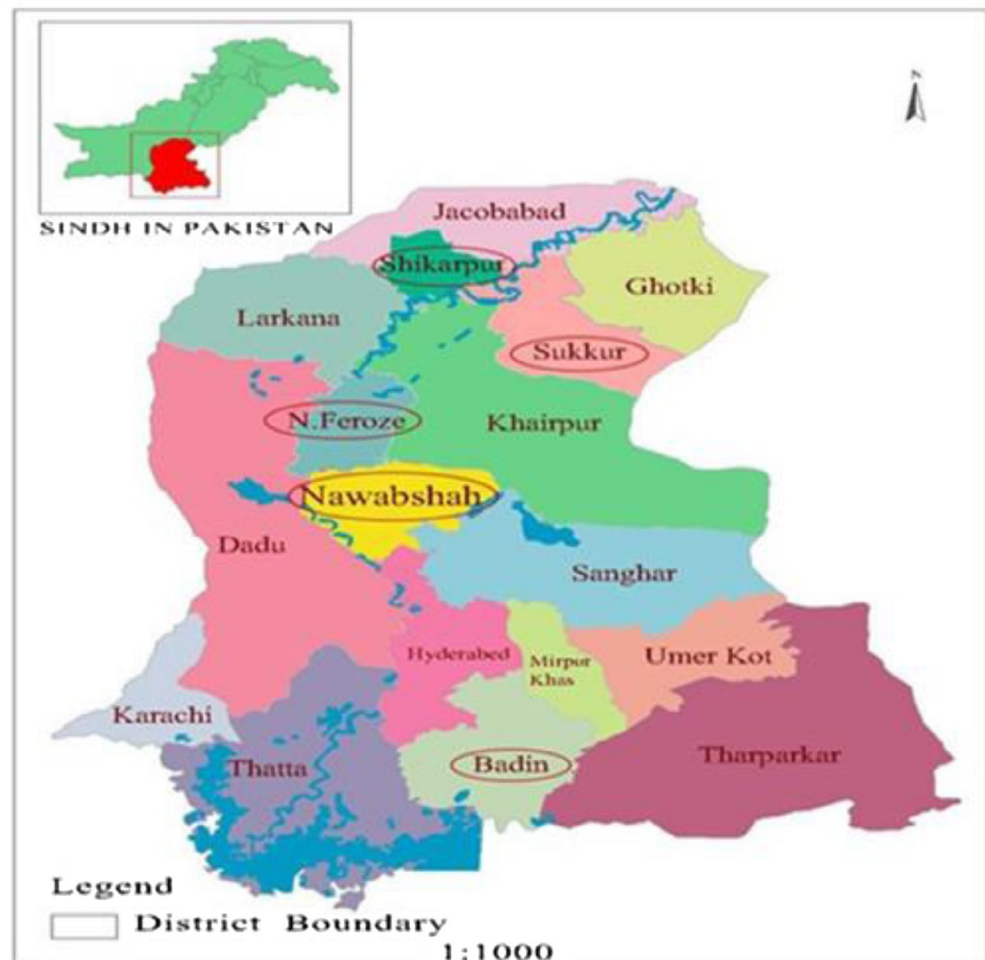
Figure 2. Map of study area.

Accessibility can be defined by the utility maximization theory. It is expected that a rural household will desire to access credit if the utility derived from credit accessibility levels highest compared to the utility derived from not accessing the credit. In this study, accessibility of credit is assumed to be binary choice such that a rural household is expected to either borrow credit or not. A farmer is therefore expected to have access to credit for the highest marginal benefits. Let the state of accessibility be represented by Pr , where Pr = 0 for no access and Pr = 1 for access. If it is assumed that the error term follows a normal distribution, then the estimation can be achieved using a probit