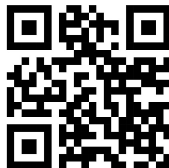
Fig. 1. Example of a QR-code.

The use of QR-codes for SMARTVINO project is recommended because of a lot of pros. First of all, QR-codes are very popular, thus the presence of one of them on the wine label