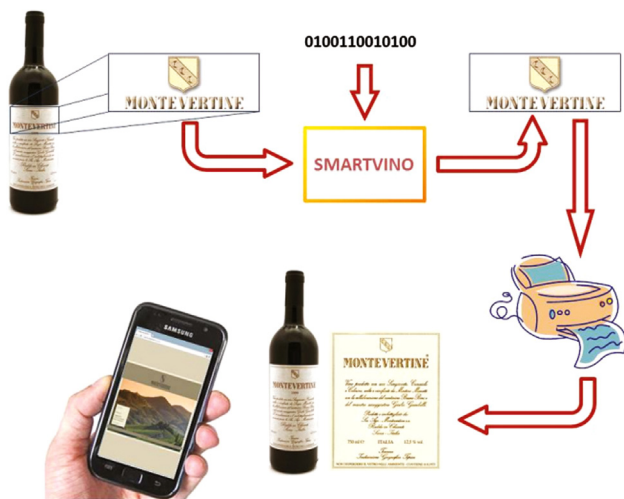
Fig. 4. Scheme of the proposed SMARTVINO system.

by year, by selected ID groups, etc.), but this is a choice which can be managed server-side, on the basis of the needs of the farm.