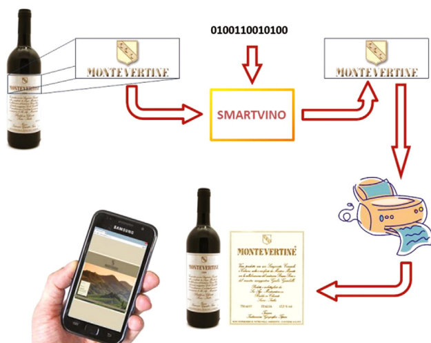
Fig. 4. Scheme of the proposed SMARTVINO system.

by year, by selected ID groups, etc.), but this is a choice which can be managed server-side, on the basis of the needs of the farm.