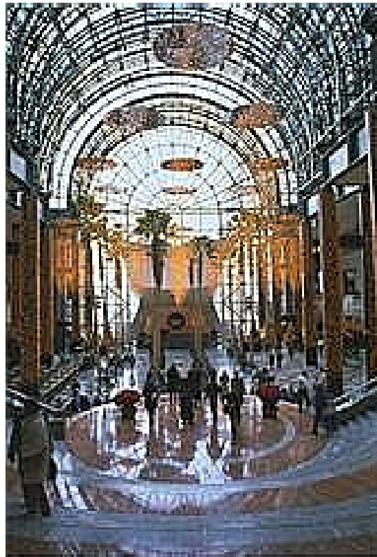
Figure 2: A Mall for the World

Nevertheless, accomodation and adaption to the global is never perfect. Concerns for the views of shareholders, employees and clients often call for a local element. For example, British resistance to modern art in general, and abstract art in particular, which occasionally is interpreted as a result of the "literary" orientation of the culture (Hall 2000) certainly is reflected in the choices of financial institutions in this part of the world.