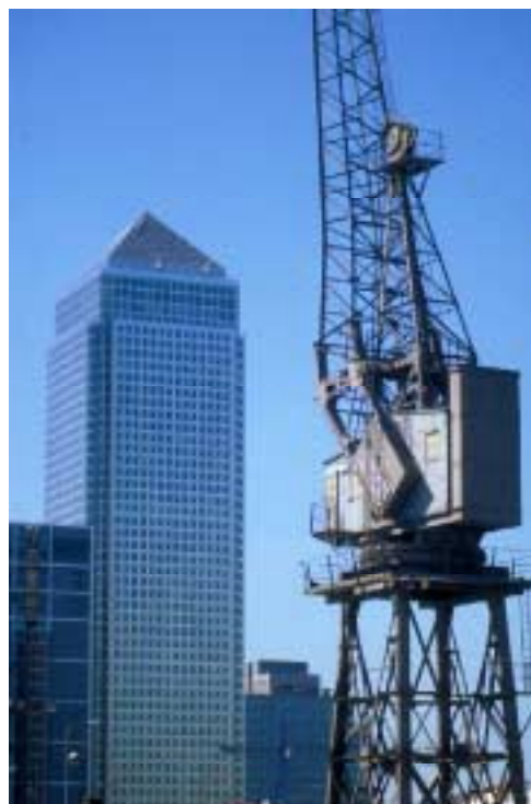
Figure 5: Canary Wharf

Part of the cities' efforts to get a skyline are image-building campaigns, but in parts they also reflect the need to offer an attractive infrastructure for the financial community. Among other things, the new skyscrapers have the function "to lift urban identity from the modern to the spectacular" (Zukin 1992: 196). A comparison of the urban landscape of European financial centers now and ten years ago demonstrates that the skyline as a determinant of financial market competition in Europe is quite a new phenomenon. In the early 1980s none of the big European centers had an accumulation of buildings worth calling a "skyline". Paris, Zurich, Milan and Amsterdam still have none. For the City of London, even nowadays a true "skyline" cannot be identified. Only in Canary Wharf builders have begun to model the site respectively - apparently in reaction to developments on the continent (figure 5). However, as also the name "Mainhattan" for Frankfurt indicates, the original example in this and other cases still is New York.