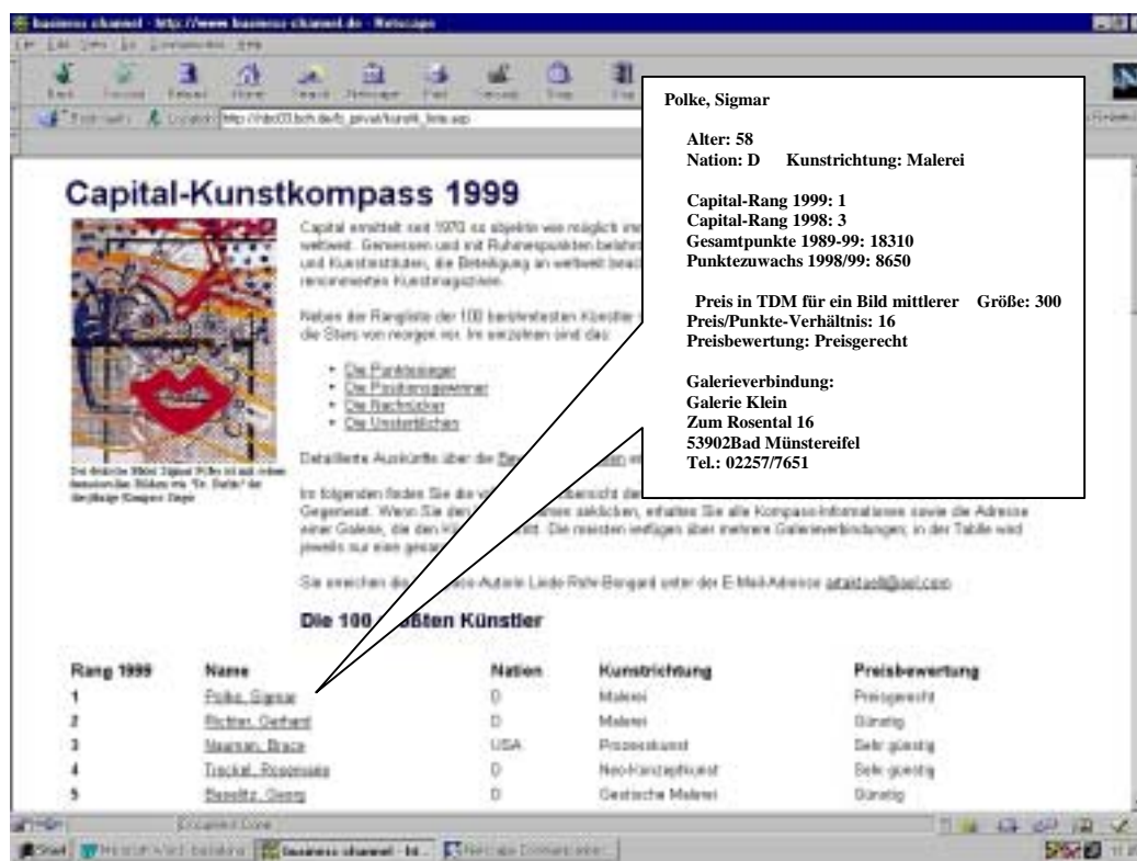
Figure 1: An "Art Compass"

galleries and reviews in international art magazines. 4 Beside the artist's name, age and nationality, as well as a work classification, information is given about prices and galleries (figure 1). This is but one example of decision help and orientation provided by the media for an international clientele of customers and sponsors. These and other activities are largely contributing to the observed tendency of worldwide adjustment of tastes and demands which increasingly raises worries about an overly adaption and accomodation of culture to the needs and demands of a global community. There is a widespread fear of banalisation of the arts through financial dependencies (Frey and Pommerehne 1993), a worry that corporate collecting and sponsorship is creating a new definition and understanding of art.