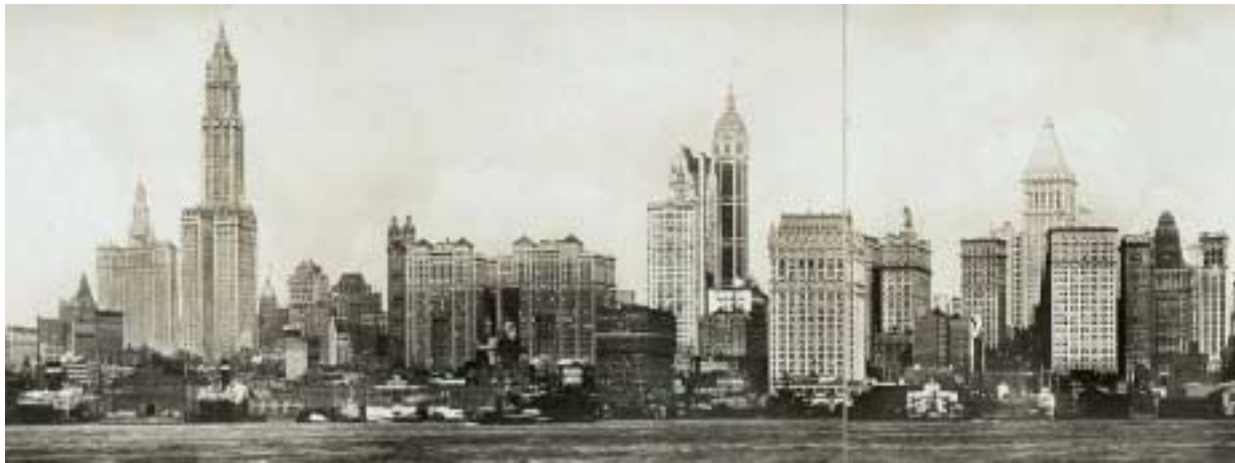
Figure 3: A Symbol to the World

efficiency and flexibility, mobility and speed with which financial decisions are made, the high degree of information and transparency in the markets, but also traders' greed and willingness to take risks. Others refer to the grand narratives of the profession constantly being retold and re-interpreted - of fabulously rich clients, big industrial tycoons and highly influential financiers determining the fate of whole nations. And myths are also established around places. While Paris long had been famous for being the world's cultural metropole London was considered the world capital of finance until New York took this role in the 1920s. All financial centers are constantly trying to live up to the claim of being a "world city". Besides, there are also myths about special locations in cities such as Wall Street or Lombard Street.