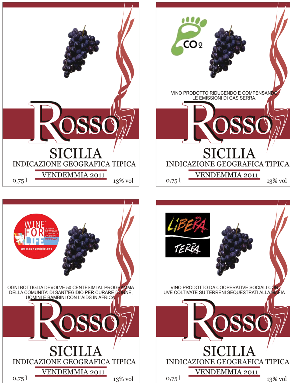
Fig. 1. Labels used in the experimental auctions.

half the session, all bidders would generally be more engaged. We made it clear to the subjects that only one round and one product would be binding, to avoid demand reductions and wealth effects (Shogren et al., 1994). All data were analyzed with STATA statistical software (version 11.0).