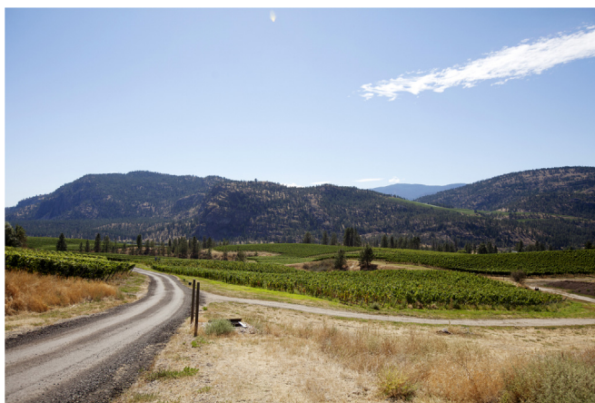
Fig. 2. Landscape matrix of vineyards.