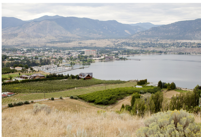
Fig. 3. City of Penticton.

Rapid urban development and land use changes have further stressed a tenuous water supply (Cohen et al., 2006; Hobson, 2006; Angel et al., 2016; Okanagan Collaborative Conservation Program and South Okanagan Similkameen Conservation Program, 2014; Brewer & Taylor, 2001; South Okanagan Similkameen Conservation Program, 2000.; Wagner & White, 2009). The Okanagan is the most water scarce region in Canada with less water available per person than anywhere else in the country, yet communities use more than twice the national average (Angel et al., 2016). Part of the problem rests with perception – a massive lake anchoring the valley makes it difficult for people to think about water as a threatened resource – yet both water supply and water quality in the Okanagan Valley have reached critical tipping points. Demand is outpacing supply with ongoing changes to the valley's hydrological system stemming from development, agriculture, a growing population, and global warming.