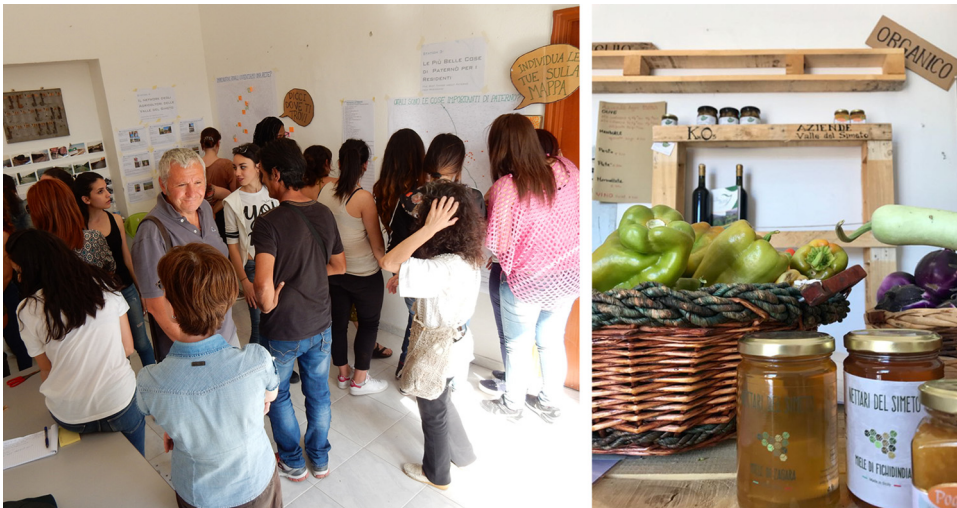
Fig. 4. On the left: community members participating in open house to re-envision the future of the San Marco Station; on the right: some of the Simeto River Valley products sold every week at the San Marco Station.