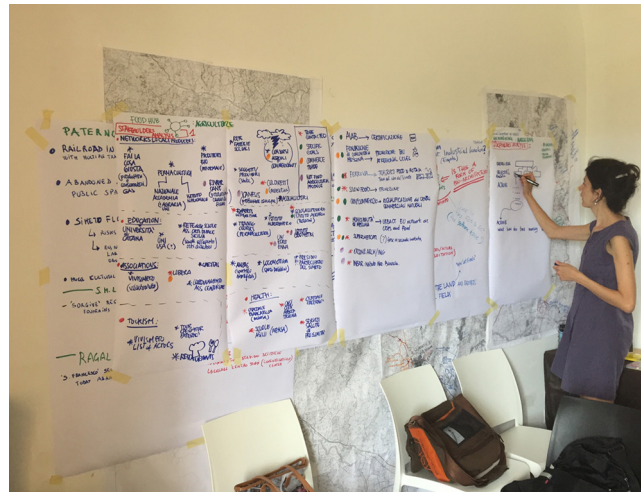
Fig. 3. CoPED 2015 students' workshop on the Simeto River Agro-Hub Project.

dimensions of participants' knowledge. These included, for instance, the joy of using agriculture to re-discover the forgotten riverine system, not only responsible for the most exclusive agricultural products, but also as a fundamental feature of the local cultural identity and the fear of dealing with illegal activities and organized crime. The hub was officially formalized in 2015 with the name of Simeto Bio-District and today counts 65 members – including 25 farming businesses, 15 farmers, 11 agronomists, 8 professors, 6 students and professionals – who are engaged in a community-based process to formalize the “quality certification” criteria.