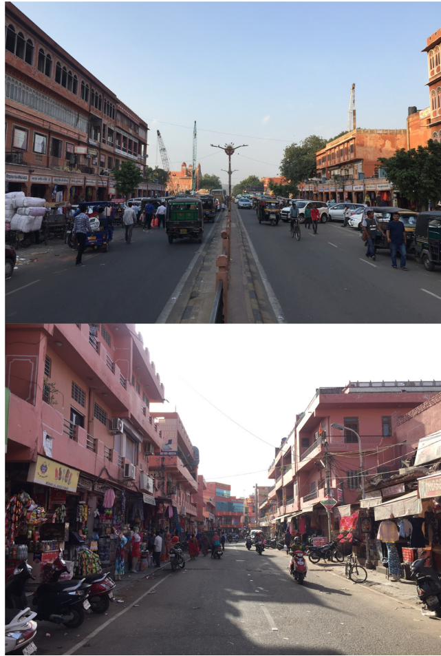
Fig. 2. Market Streets: (Top) - Wide rectilinear street with covered pathways in Johari Bazaar (old city)& (Bottom) - Narrow and encroached street at Adarsh Market, Barkat Nagar (Latter Development).

complete loss of Mansagar Lake, which once used to be the source of portable water supply for the city, and depletion and shrinkage of the seasonal river – Amanishah Nala (also called as Dravyawati river) flowing across the city. The unregulated development in and around urban forest and eco-sensitive zones has led to incidents of wild animals like leopard crossing over into the urban residential areas.