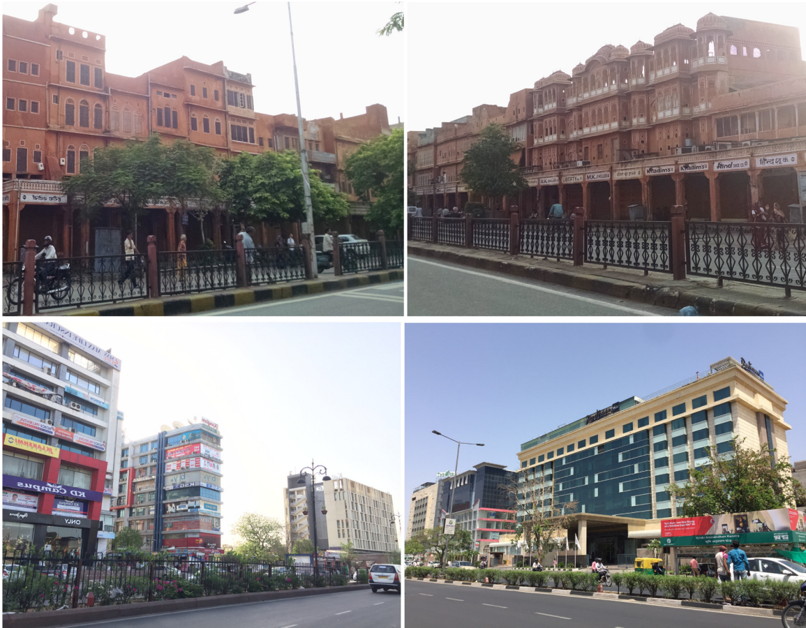
Fig. 3. Street Facade Characteristics: (Top) – Continuous & Complementary (walled city) & (Bottom) – Fragmented & Contrasting, at Tonk Road (Latter Development).

etc. due to lack of integrated and clear-cut frameworks, guidelines and regulations. The Building byelaws for residential development as prescribed in the building regulation (Table 1) is as follows: