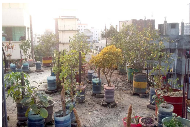
Fig. 1. Overview of the Garden in Mirpur. Field Survey, 2016

Though Mrs. Nahid (Mirpur area) started with mainly flowers and guava trees, now almost 3/4th roof area of the garden is covered with vegetables including Tomato, Brinjal, Bean, Lady's Finger, Chili, Capsicum, Cabbage, Gourd, Spinach etc. and some fruit trees such as Guava, Wood Apple, Sweetsop, Lemon etc (Fig. 1).