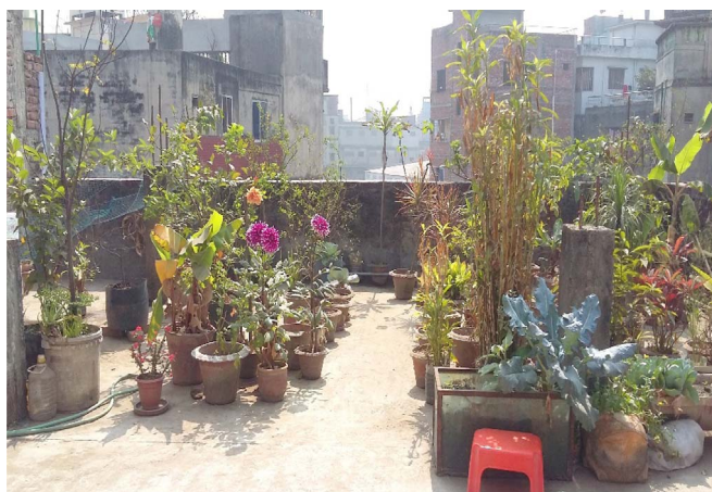
Fig. 2. Overview of the Garden in Mohammadpur. Field Survey, 2016

The garden owned by Mr. Ahmed (Mohammadpur) is covered with variety of vegetables, fruits, flowers, medicinal and ornamental plants. Vegetable species in the garden includes- Cabbage, Cauliflower, Broccoli, Tomato, Brinjal, Onion, Cucumber, Chili, Capsicum, Lettuce, different types of Spinach etc. Fruit species which are grown in the garden includes- Guava, Orange, Malta, Mango, Banana, Star fruit, Amloki, Pomegranate, Wood Apple, Amloki, Lemon etc. Some other plants include Drasina, Euphoria, Alovera, Rose and other types of flower plants. Under the DAE project Mr. Ahmed got Guava, Mango, Star fruit, and Pomegranate plants (Fig. 2).