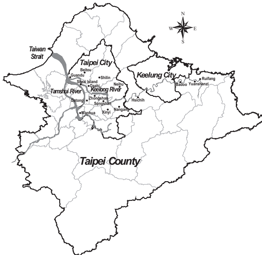
Figure 2. Taipei Metropolitan Area and its rivers

watershed has generated a considerable number of new businesses and jobs, and provided a kick-start to renewed expansion. The KR watershed recently began to serve as the strategic center from which Taipei city is attempting to accommodate globalization spatially.