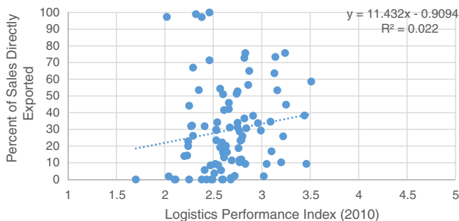
Fig. 1. Correlation between the LPI and the percentage of sales directly exported (large firms only).