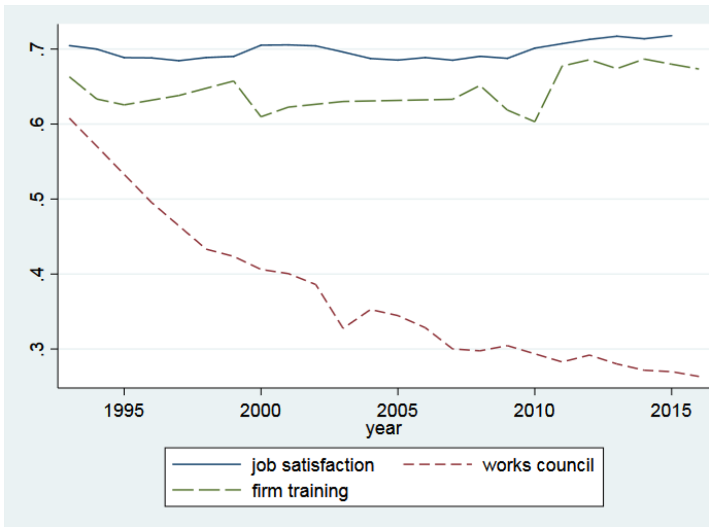
Figure 1: Development of average job satisfaction, the share of firms with training and the share of firms with a works council

Notes: The job satisfaction variable from the German Socio Economic Panel, measured by the scale 0, ... 10, is divided by 10; source of firm training and works council is the IAB Establishment Panel.