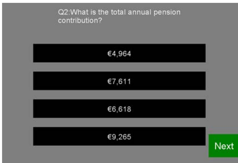
Figure A4: Example screenshot of Stage 1 Question