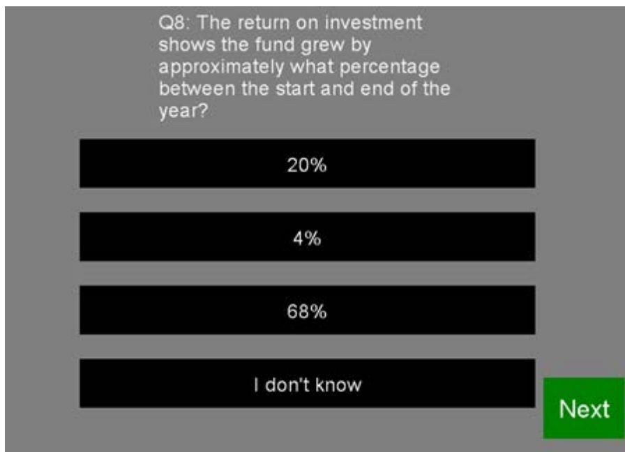
Figure A5: Example screenshot of Stage 2 question