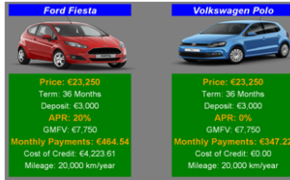
Staircase 2: Top-Down APR Titration, with large starting difference of 20% between APR values.