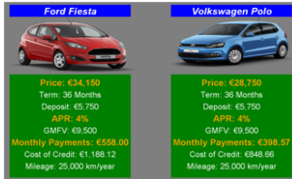
Staircase 4: Top-Down Retail Price Titration, with large starting difference of €5,400 between Price values.