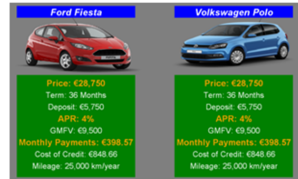
Staircase 3: Bottom-Up Retail Price Titration, with no starting difference between Price values.