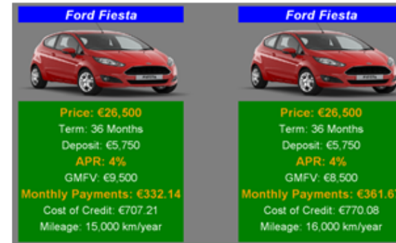
Staircase 5: GMFV titrated off against Mileage Limit.