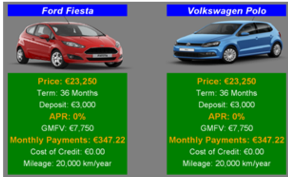
Staircase 1: Bottom-Up APR Titration, with no starting difference between APR values.