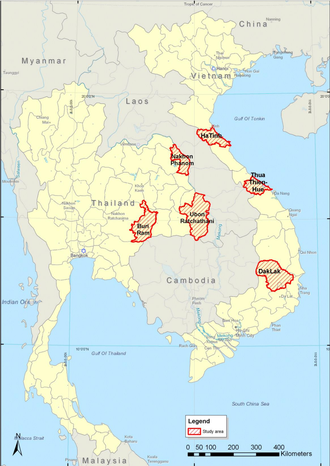
Figure A. 1: Overview Survey Region