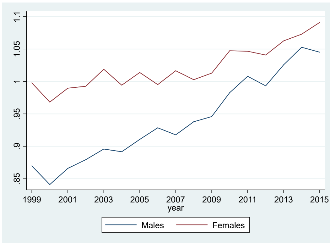
Figure 2: Average Wage for Teachers compared to Non-Teachers, 1999-2015

Notes: Source: Authors calculations using the GDS data. The figure plots the ratio of average wage for teachers to average wage for non-teachers for males and females.