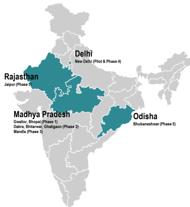
Figure 1: Study locations