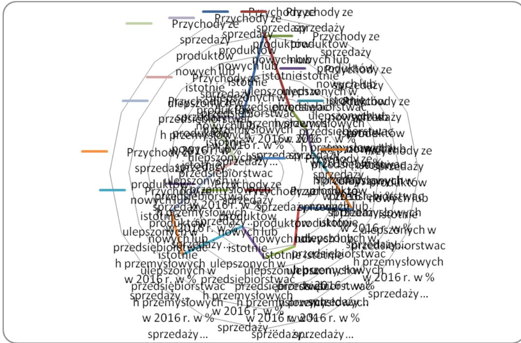
Figure 4. Revenues from sales of new or significantly improved products in industrial enterprises in 2016 as percentage of total sales