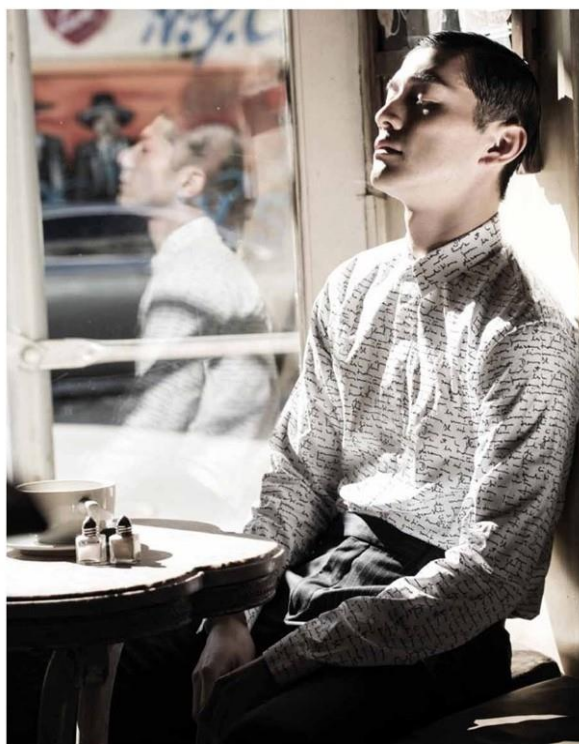
Figure 8. Photo in Manifesto magazine, spring 2015: 11