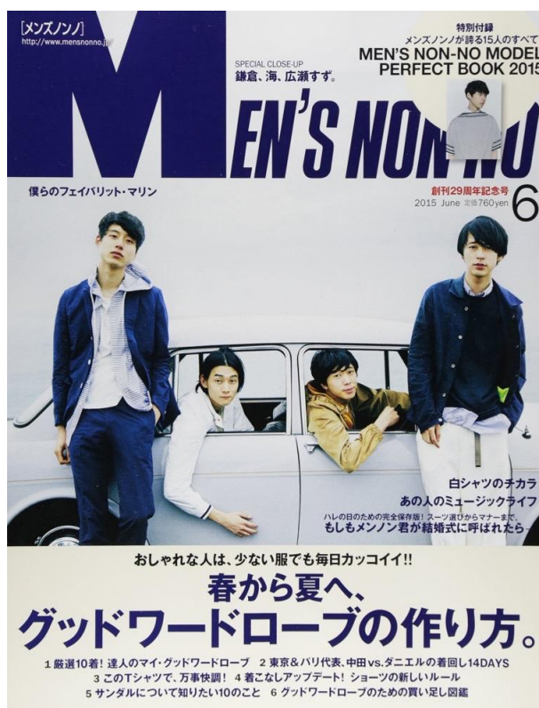
Figure 10. Cover of Men's Non-no for June issue 2015