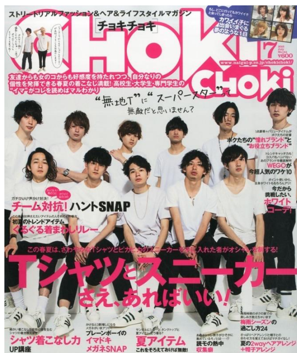
Figure 11. Cover of July issue of ChokiChoki magazine, 2015

Gyaru-o kei (ギャル男系, ギャルオ系, ギャル汚系) 11 known also as gal-o kei 12 (sometimes referred to as vui-o , V-o , V男 , ヴィオ because of deep-cut V-neck sweaters and T-shirts representing it (Namba, 2006: 107) derives from the female visual style generally called gyaru kei (ギャル系). This style has a very developed structure, covering such sub-styles as ane-gal (older representatives of gyaru ), mama gal , b-gal (“b“ from “black“, emphasizing connections with rap music), ganguro with extreme deep-brown tan, bihaku gal with pale faces, yamamba (the name derives from yamamba – mountain witch) wearing characteristic dark make-up with eyelids painted white, and hair dyed platinum blonde. The list is quoted after Angelaka (2012), Watrous (2000), Suzuki and Best (2003), Marx (2012), Miller (2004). These characteristics correspond to their male counterparts of gyaru-o .