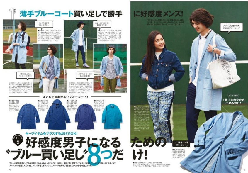
Figure 5. Selected pages of June issue of FINEBOYS magazine, 2015: 42- 43

Source: http://www.amazon.com/FINEBOYS-Japanese-Fashion-Magazine-JAPANESE/dp/B00ULU39RK . Accessed: 5 June 2015.