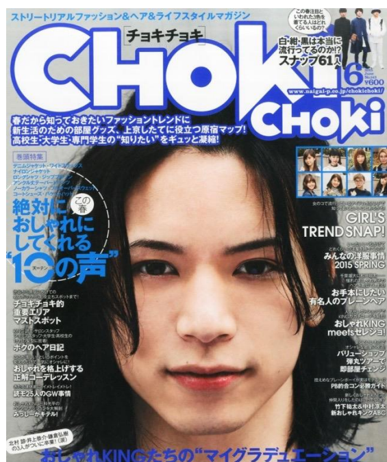
Figure 12. Selected pages of current FOR WHEN issue of ChokiChoki magazine