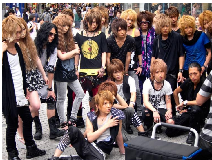
Figure 13. A group of gyaru-o and three gyaru-kei girls

Urahara mode kei (うらはらモード系) is a style corresponding to Western street fashion, and that is why it is sometimes described as street mode . Urahara mode kei derives from the name of the Uraharajuku (裏原宿, うらはらじゅく) a district in Shibuya ward, Tokyo. Teenagers and twenty-year-olds representing this style read such magazines as Tune (in print since 2004, Groom, 2001: 199; Wikipedia, 2015e), Ollie (published since 1999), Samurai magazine , smart (this title was mentioned in the description of kireime kei ), COOL TRANS . 15 This style is inspired by the American casual, usually that represented by skateboarders, look of pageant, yet simple. It is characterized by earthy colors, ethnic prints, soft, fluffy fabrics and is considerably influenced by the trends of the season.