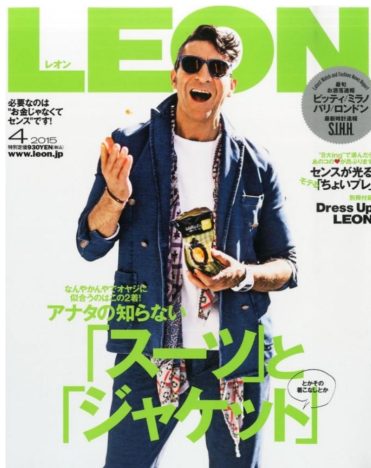
Figure 7. Cover of LEON Magazine for City Boys for April issue 2015

While describing mode kei , one must stress, that Japanese man is not overlooked by the Western market; on the contrary, he is receiving special attention. An example of this are collections by British fashion company Burberry, directed by Christopher Bayley: Burberry Black Label, or a collection of French Maison Lanvin Lanvin en Bleu, tailored for Japanese market (Sherman 2014), slightly more affordable than the “original” collections. One of the reasons for this, could be the body type of a Japanese man, different from the Western one. The other reason, much more important from the financial point of view, is the fact, that according to Euromonitor (data from Deloitte Touche Tohmatsu Limited, 2014: 4, 6), Japan is the second (albeit twice smaller than the USA which ranks the first) luxury goods market in the world. Japanese consumers make demand for 40% of global luxury goods market every year, Morimoto and Chang (2009).