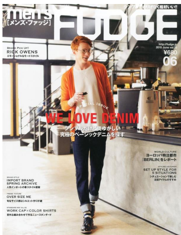
Figure 9. Cover of men's FUDGE for June issue 2015