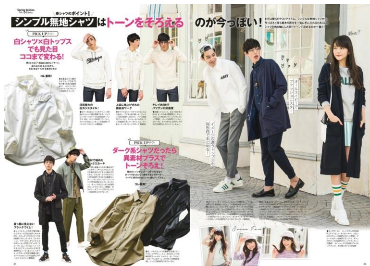
Figure 3. Selected pages of April issue of FINEBOYS magazine, 2016: 60-61

interview with editor of Men's X , Tanaka, the term kirei onī kei describes a man who is not a part-time worker like furītā 5 (フリーター), freeter, neither low on income like gyaru-o (representative of another style described, further in the paper), but a man socially responsible, acting mature, at the same time not being as uptight as a salaryman .