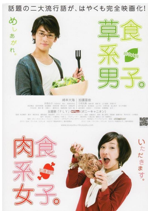
Figure 14. Poster for the motion pictures “Sōshokukei danshi” and “Nikushokukei joshi”

With reference to six styles of self-expression, one might come to the conclusion that all of them, with one exception, could be assigned to a new type of masculinity sōshoku danshi . This one exception is gyaru-o kei , a counterpart to the British new lad (the man behaving badly, Tanaka, 2003: 222; Edwards, 1997: 87), the remaining types could be described as representatives of the city boys, a term coined by one of the first magazines for young men in Japan, which contributed to the creation of sōshoku danshi , Popeye , as it was mentioned earlier in the paper.