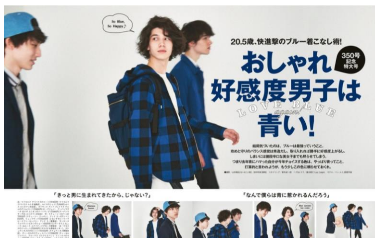
Figure 4. Selected pages of June issue of FINEBOYS magazine, 2015: 32-33