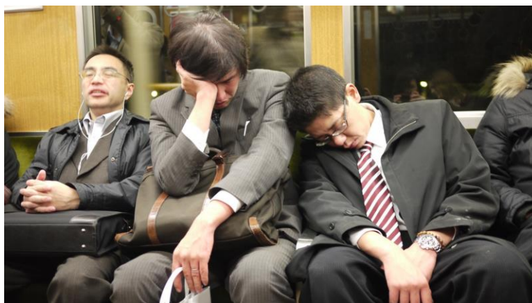
Figure 1. Salarymen on their way home from work

✓, sararīman ) 1 is a middle class, white-collar office worker, employed in a Japanese corporation, Lockar (2009: 784), in the sense of a man of success. At the same time, he is a person that embodies the notion of a Japanese man, archetypical husband, father, supplier of goods for the family. As Dasgupta (2003: 119) mentions, salaryman has become a dominant pattern of masculinity in Japanese society after World War II, an ideal to be mimicked by future generations. Is this slightly ruffled, like a white shirt and dark suit after the whole day of work, the image still visible in the Japanese streets and office buildings (Figure 1), or is it being displaced by other images?