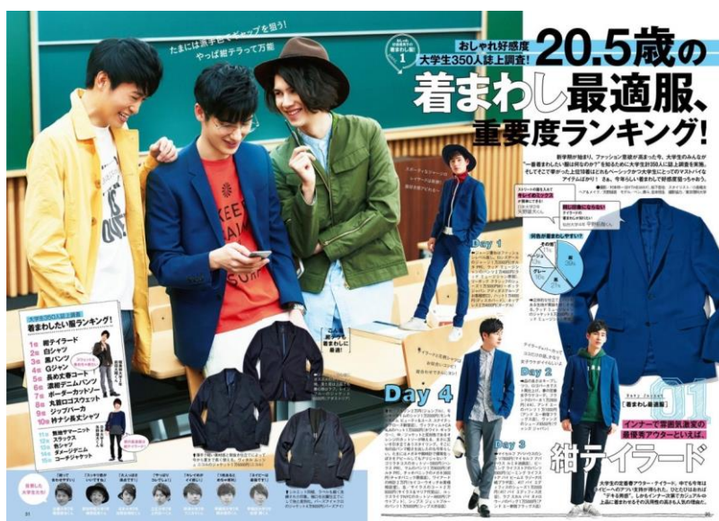
Figure 2. Selected pages of May issue of FINEBOYS magazine, 2015: 31-32

The base attribution of kireime kei style is a collar shirt (usually plain), or a T-shirt, a tie, slim-fit jacket or a cardigan and skinny trousers. Taking into consideration all of the above, this aesthetics could be described as boish-man one. The examples are shown in Figures 2-5.