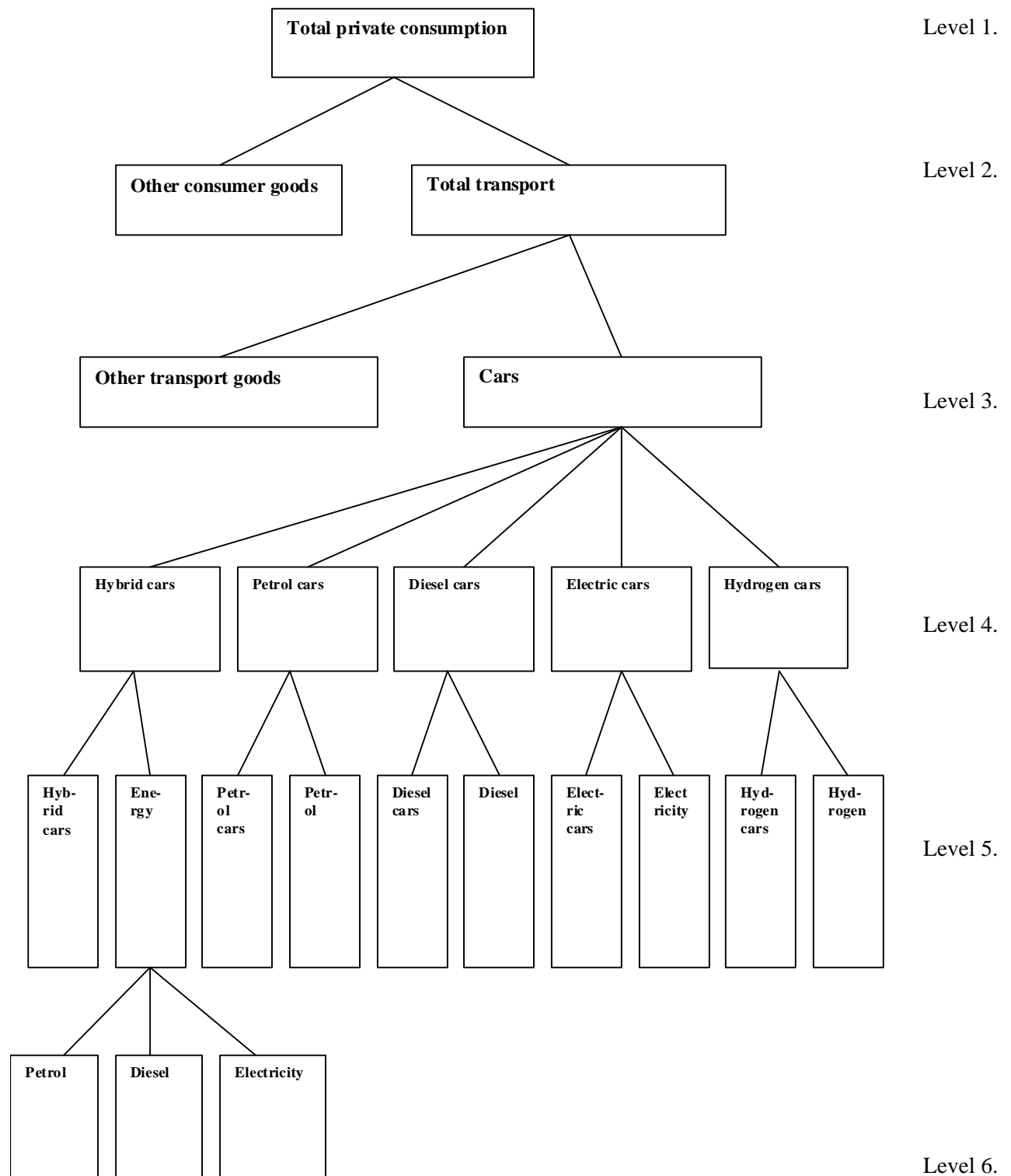
Figure 1. The CES-utility function