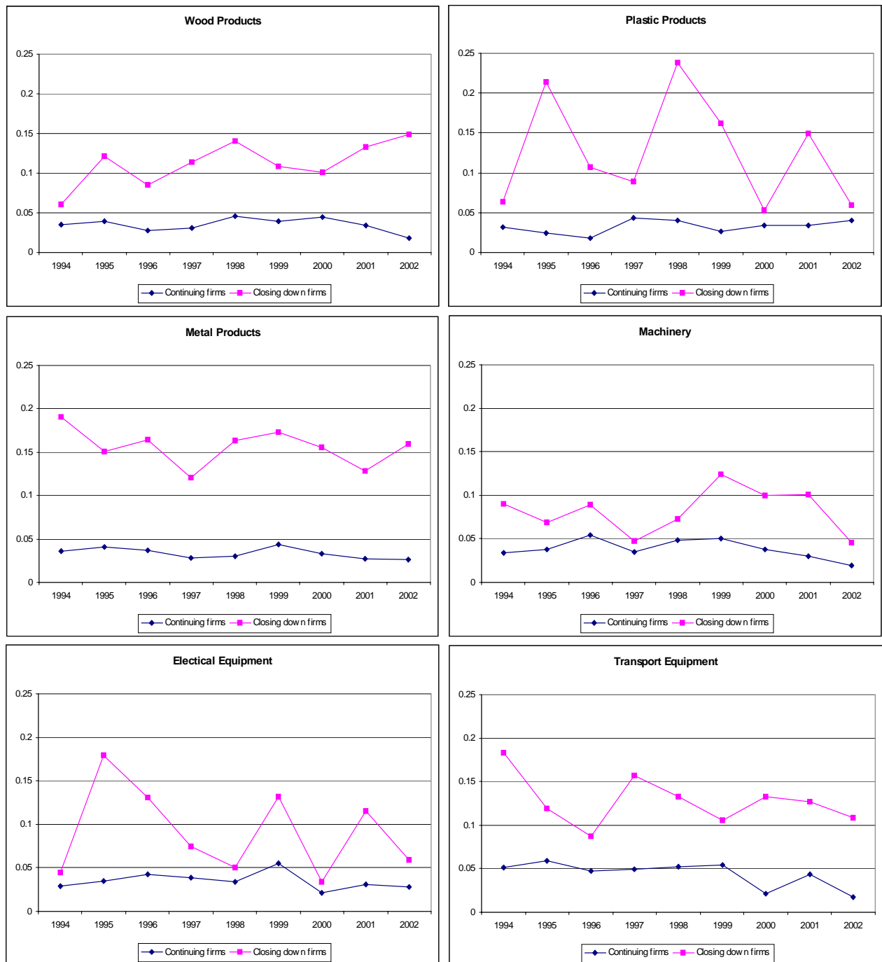
Figure 1: Estimated aggregate exit probabilities for continuing firms and closing down firms