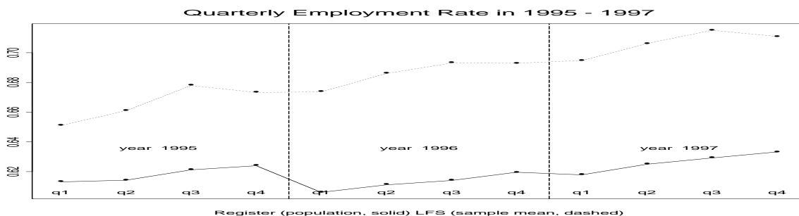
Figure 1: Register-Employment and LFS-Employment in Norway from 1995 to 1997

In several countries including Norway, a Register-Employment Status is available for the entire population. These administrative registers are prepared independently of the LFS, and can be linked to the LFS at the individual level. In this case study we focus on the LFS-Employment Status as the survey variable, and use the Register-Employment Status as the auxiliary variable. Both are illustrated in Figure 1 below, where the solid lines connect the quarterly population Register-Employment Rates, and the dashed ones the quarterly sample LFS-Employment Rates.