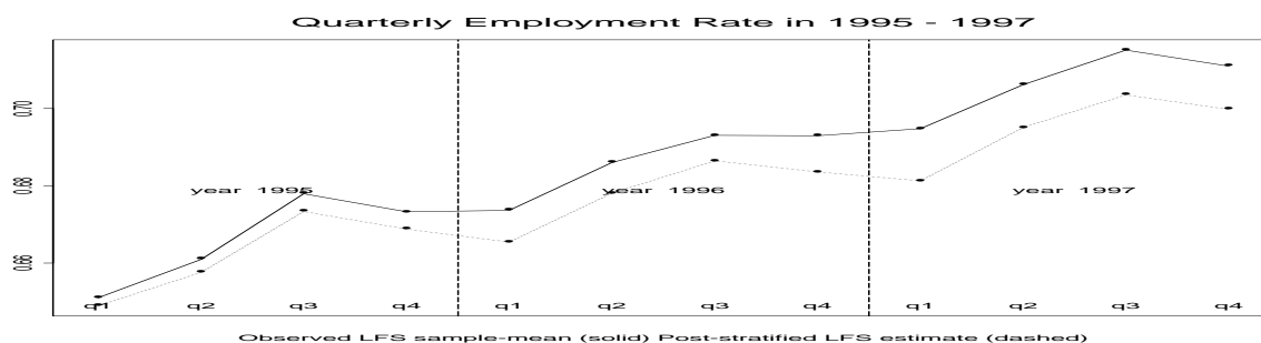
Figure 4: Register-Employment Rate in the Norwegian LFS from 1995 to 1997

decrease is approximately three times the standard error of the estimate. This relatively dramatic difference immediately raises the question whether the sample size is too large. However, the Labour Force Surveys are multipurpose, and therefore an evaluation of the adequate sample size should include a discussion about which economic indicators are the most important ones produced from the surveys. Furthermore, it should be stated what accuracy, included accuracy of changes, one is aiming at. As seen from the study the accuracy of changes are not affected by the use of post-stratification.