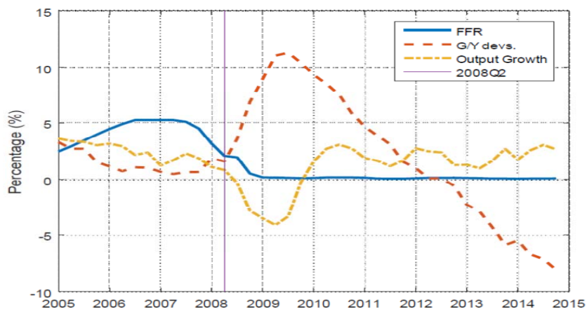
Figure 1: US real GDP growth and monetary and fiscal policy indicators before, during, and after the Global Financial Crisis.

This monetary-fiscal policy mix was in place in other countries as well. In Australia, the cash rate was cut by 425 basis points going from 7.25% in August 2008 to 3% in April 2009. At the same time, Australia's Government surplus over GDP moved from 1.7% in 2008 to a record low -4.2% in 2012. 1