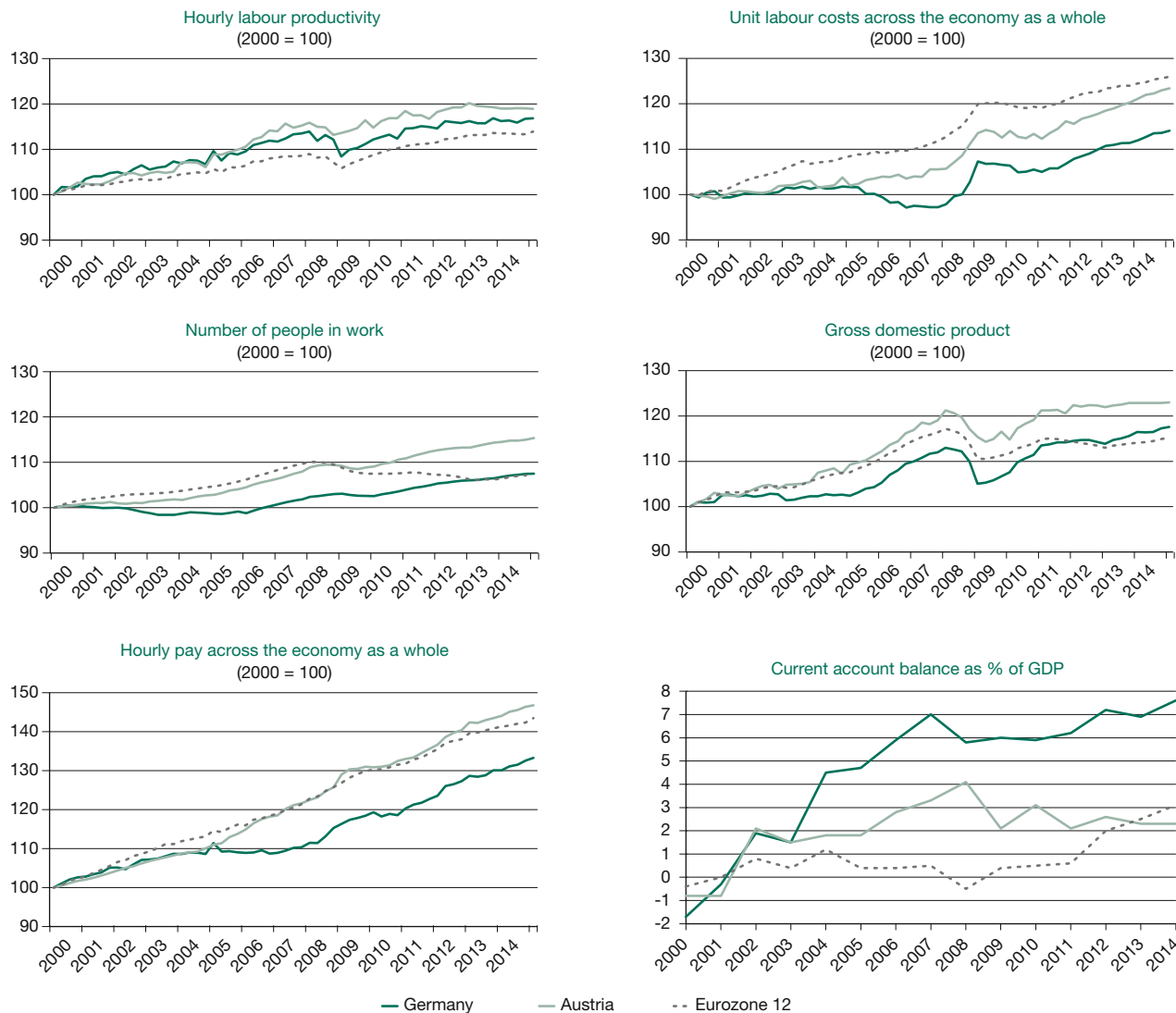
Figure 2 Economic development and competitiveness indicators for Germany, Austria and the eurozone

Note: Eurozone 12 countries include the 12 eurozone members as of 2001: Germany, Austria, the Netherlands, Finland, Luxembourg, Belgium, France, Ireland, Spain, Italy, Portugal, Greece.