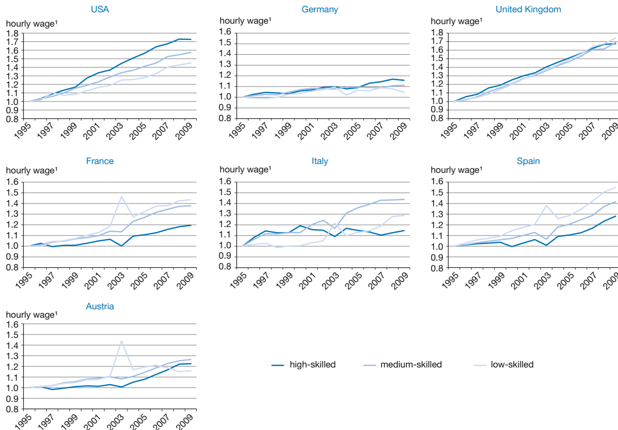
Figure 2 Hourly wages by skill level

1 x-skilled hourly wage = (share of x-skilled in labour compensation) * (total labour compensation) / (share of x-skilled in hours worked * total hours worked); year 1995 is set to 1 for each country.