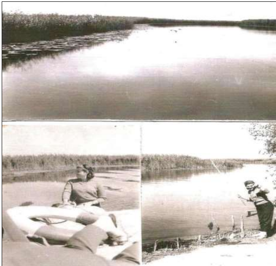
Figure 4. Civilized tourism could become one of the important economic resources in the Danube Delta

Why did not the authorities act forcefully in the Danube Delta, as happened in the Danube Floodplain? The answer to this question remains an enigma. Despite the warnings that the land taken out from under the water would degrade (swamp formation, secondary salinity, aridization), hundreds of thousands of hectares were assigned to agriculture . This could be explained by the tacit acknowledgment that in the Delta the negative phenomena would have been much more difficult and more expensive to control. Moreover, we should not forget the failed attempts to embank, drain and use as permanent dry land some land areas from Mahmudia (undertaken by the Dutchman Hangeveldt) and from St. George branch (undertaken by the Danish Ditgmer) (1895).