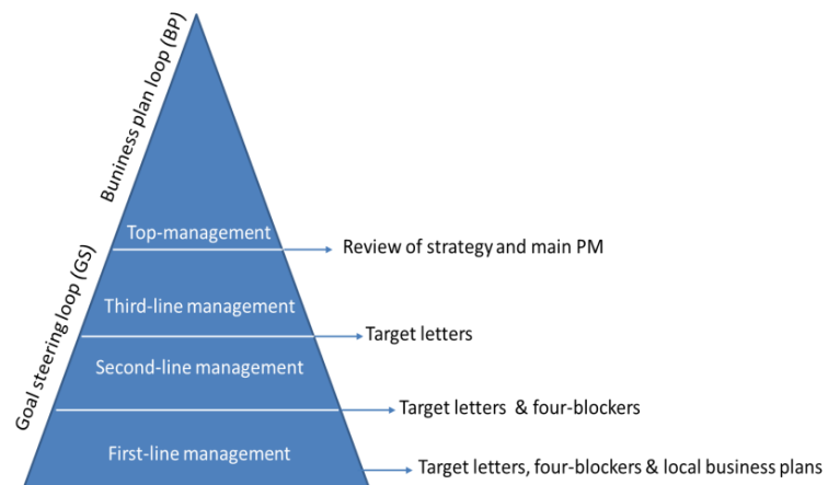
Figure 2: The BP&GS loops and their outputs.

Analysis of management system guidelines and interview responses from across CC2 revealed that the first review process adopted a top-down approach and consisted of two loops, a business planning (BP) loop and a goal steering (GS) loop (Figure 2). According to management interviewees and documentation obtained from the intranet, the purpose of the BP loop was to ensure that the strategy of the organisation had been reviewed whilst the GS loop aligned the PM scorecards across the organisation with the reviewed strategy. Once the top-management team had finished their BP loop and updated the strategic material and main PM, the objectives and PM of the organisation were reviewed through the GS loop. The BP loop was thus the first process step and was confined, participation wise, to the top-management. Process material and interview responses exhibit that the GS loop was executed in a chronological fashion with output of higher hierarchical levels serving as input for the lower dittos. Moreover, the output was meant to become more specific and detailed the further down the GS loop was drilled (Figure 2). At, first-line management level specific actions were meant to be assigned to the PM and goals through the development of local business plans. The GS loop was concluded once the lowest levels of CC1 had reviewed and updated their PM and goals for the coming year.