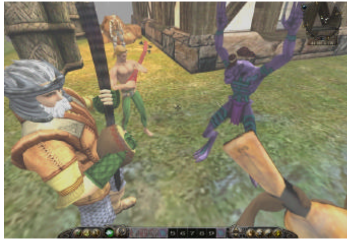
Figure 3: Gopher Tail Minstrels in action somewhere in the realm of Asheron's Call 2.

Actually, the case of Gopher Tail Minstrels is by no means unique. The loss of one's game character may well be more than just a loss of virtual artefact. And people may react very strongly in that kind of situation: "On December 25th, 2006 I woke up to a big surprise. No, not a big pile of presents! I woke up to find my World of Warcraft character no longer existed. You may say, 'Sure it's just a video game, what's the big deal?' Oh, when you put 286 days of playtime in one character, it is a huge deal." (My Crazy Blog 2006). This player, according to his own testimonial, was prepared to sue the guilty party with no expenses saved approach. He continues: "Now, for the fun part. Finding a law firm that will pursue this case. I will be suing for the 286 days of life this man stole from me, and the $2000 it cost me to figure out everything about him." The value, in this case, is not just memories. It can grow to become something even money cannot buy.