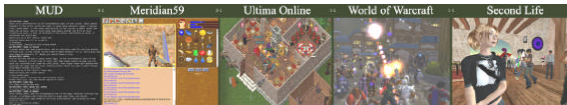
Figure 1: Development of MMOGs from MUD to World of Warcraft and Second Life.

While the history of MMOGs is by far too rich to be exhaustively discussed in this paper, we will provide a brief outline of the most influential developments by bridging the key issues with the potentially important implications for virtual and real economies. Figure 1 illustrates some of the key MMOGs that emerged during this 30-year period. The history of MMOGs starts in the late 70s with systems that hardly resemble the contemporary multimedia spectacles available on the today’s Internet.