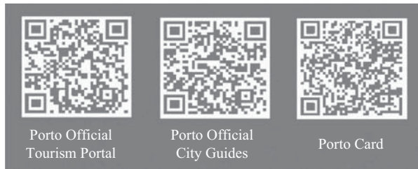
Figure 2. Examples of use of the QR code