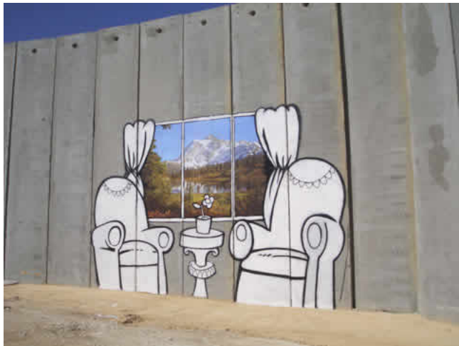
Figure1: window on the West Bank