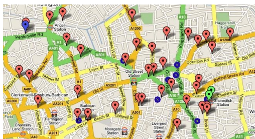
Figure2: Banks’s google map that audience could through self-mediation access graffiti.

“Jurgen Habermas’s Both initial and reformulated account of the public sphere (1989, 1992)”. Silverstone noted that “critics are concerned not just about the media’s vulnerability to influence, but their general contribution to political apathy, and their distortion of the relationship between public and private lives and spaces (Eliasson, 1998: Putnam, 2000: Thompson, 2000)”. Through self-mediation, citizen can search online to note the graffiti (Figure2).