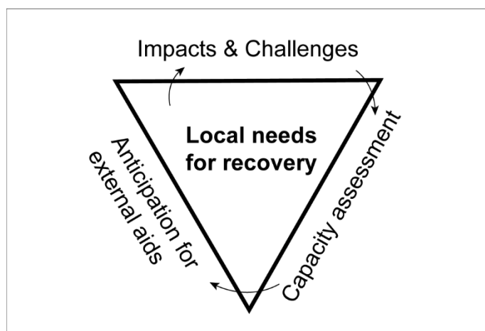
Figure 1. Conceptual framework for post-disaster needs assessment.

information regarding three aspects at community-level: the disaster impacts and ex-post challenges, local capacity and anticipation for external needs (Fig.1).