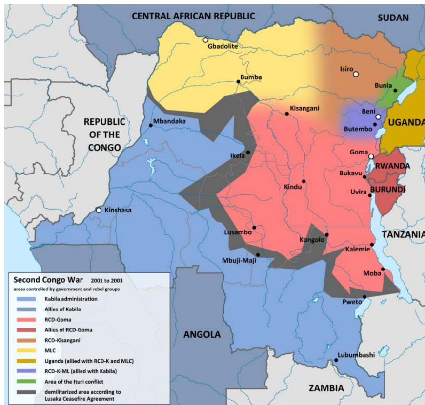
Figure 2: Map of the second Congo War, 2001–2003

2