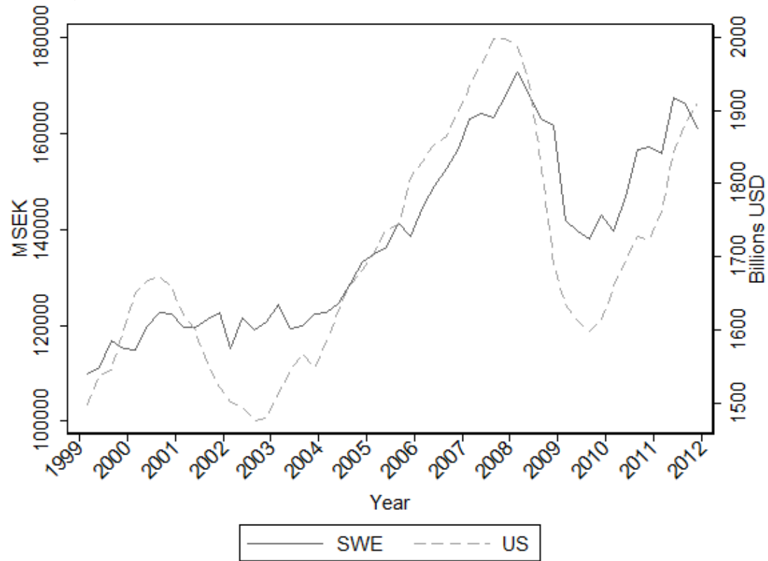
Figure 1: Investment in Sweden (left y-axis) and the US (right y-axis). Gross Fixed Capital Formation MSEK, 2012 Prices, US Total Private Non-residential Fixed Investment, 2009 Billions USD.