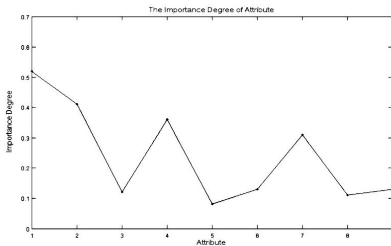
Figure 2. The Importance Degree of Attribute

In this problem, we with a no duplicate completely coverage of domain, the principle is priority select the max coverage of U of neighborhood. This article set the step length of \delta as 0.05, through adjusting relations between \delta and neighborhood to reach the best attribute reduction. In this article, we use MATLAB to reduce attribute. Results are as follows: