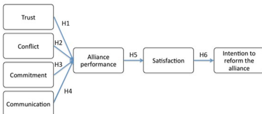
Figure 1. The research model

In this chapter, we develop a comprehensive research model based on a series of literature review. Based on the research framework, the hypotheses are developed to describe and verify the relationship among individual relationships, alliance performance, satisfaction and the intention of reform the alliance. The research framework is shown in Figure 1.