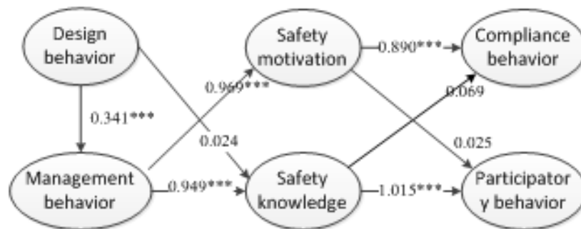
Figure 2. Research Variables and Measurement Scale

Path coefficients among theoretical models calculated on the basis of the sample data were shown in Figure 2. And *** stands for P < 0.001 . Figure 2 showed that the path coefficients were notable in the level of P < 0.001 among design behavior ==> management behavior, management behavior ==> Safety knowledge, management behavior safety motivation, safety motivation ==> the compliance behavior and safety knowledge participatory behavior.