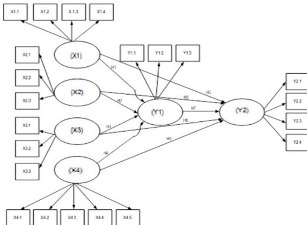
Figure 1. The research framework

Notes: Y_2 =performance; Y_1 =corporate strategy; \beta_1, \beta_2, \beta_3, \beta_4 =regression weight; X_1 =industrial environments; X_2 =operating environments; X_3 =remote environments; X_4 =internal environments. The research framework is as Figure 1.