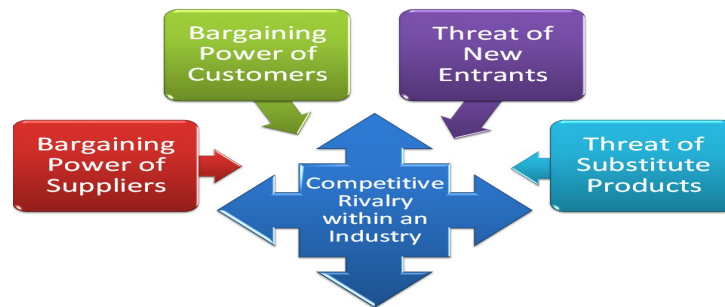
Figure 2. Porter’s 5 Forces model (Porter, 2008)