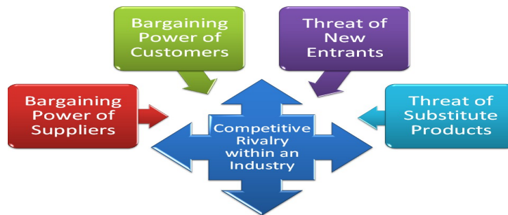
Figure 2. Porter's 5 Forces model (Porter, 2008)