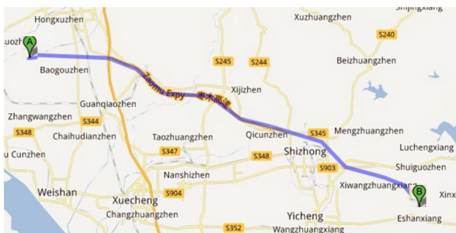
Figure 1. Transportation routing of the electricity coal supply chain

In China, the main transportation methods are railways, highways and waterways. In the coal transportation process, this paper only considers coal that is transported from the coal mine to the power plant. Ammonium nitrate and other blasting materials which are transported to the coal mine, and ammonia (NH 3 ), hydrogen chloride (HCl), sodium hydroxide (NaOH), calcium carbonate (CaCO 3 ), etc, which are transported to the power plant are not included in the LCA. According to the investigation, from JZCM to SLQP, the coal is shipped by steyr-king heavy duty trucks which have a loading capacity of 24 tons. The distance is 93 Km, the total diesel fuel consumption is 36L, and the transportation routing is presented in Figure 1.