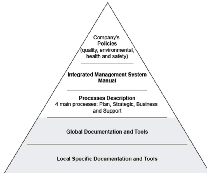
Figure 1. The case study IMS structure

The policies have the highest authority in this pyramid system, providing the IMS framework and setting quality goals for the company to achieve. The IMS Manual describes the IMS structure and methods to achieve quality, environmental, health and safety. Processes are placed in the core of the IMS, including four main types