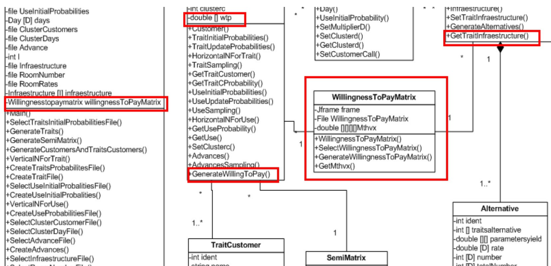
Figure 3. Subset of UML class diagram highlighting the generation of the “Willingness to pay”

The system’s behavior is then simulated as the aggregated effect of these individual decisions over time. As discussed in the next section, this approach, besides its potential for a more accurate representation of the system’s aggregated evolution, allows data access, for analysis and evaluation purposes, not only at a disaggregated level but also for data dimensions that would be non-observable in other approaches.