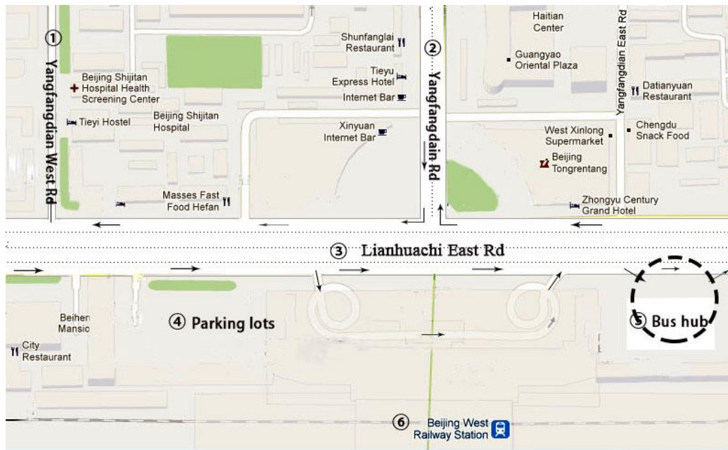
Figure 3. The 2 nd Congestion Point on Lianhuachi East Rd.

In an overall view, if we want to solve the pain of the Beijing West station congestion, the general principle is making roads smoother. Then the time of vehicles blocking on the road will be reduced, and the number of cars on the road will significantly decrease. With fewer cars on the road, road is getting clearer, which is a virtuous circle. By simulation we found that if Beijing West Railway Station south square could share some cars parking, and could cut down traffic flow to 1500 vehicles/hour, this area congestion will be improved. Meanwhile, adjusting bus interval departure time, extending to 10 minutes, could improve traffic condition as well.