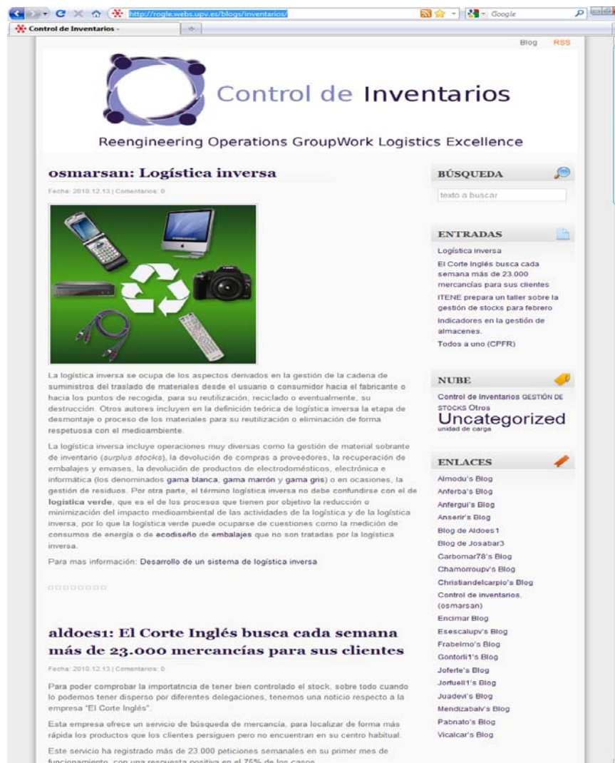
Figure 3. "Overview of a blog".