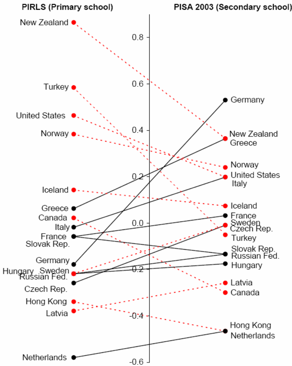
Figure 1: Inequality in Primary and Secondary School

Notes: Standard deviation of test scores in the national population (difference to international average of national standard deviations in each test). – Countries with a tracked school system before the age of 16 have solid lines, countries without tracking before age 16 have dashed lines.