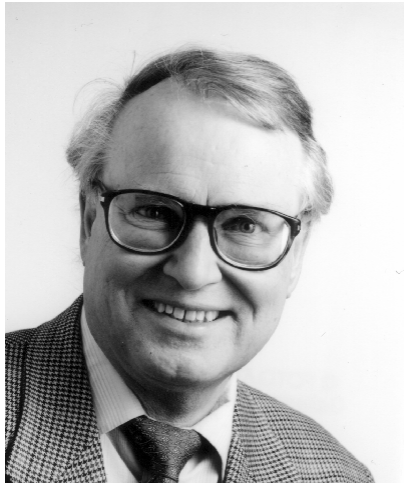
Figure 1. Assar Lindbeck