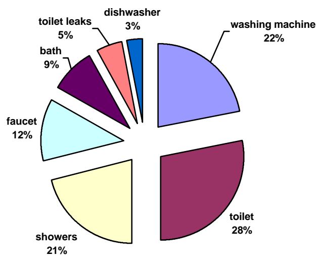
Figure 1. Percentage Residential Water Use San Miguel County, USA, 1996

Source: Hughes, Jim. 1996. "Are you a Water Hog?"