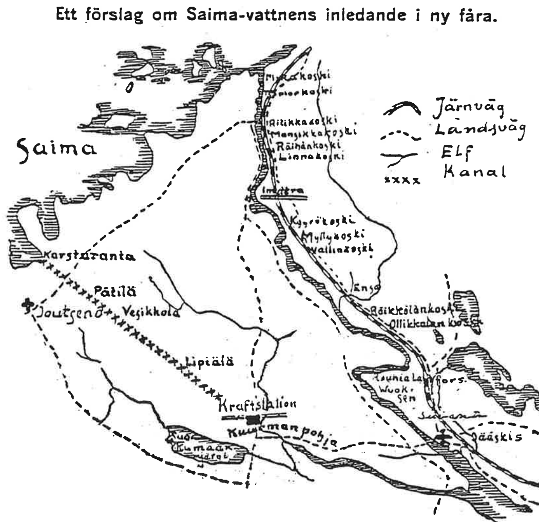
Figure 2. The Kuurmanpohja Plan: Channel and Hydroelectric Power Plant