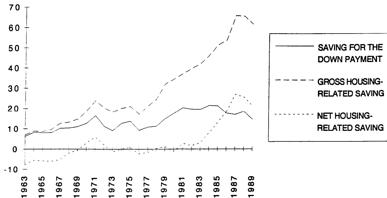
Figure 3: Aggregate Housing-Related Saving, 1963-1989 (percent of household saving)

Notes: Household saving is in net terms. Depreciation in all cases is replacement cost depreciation.