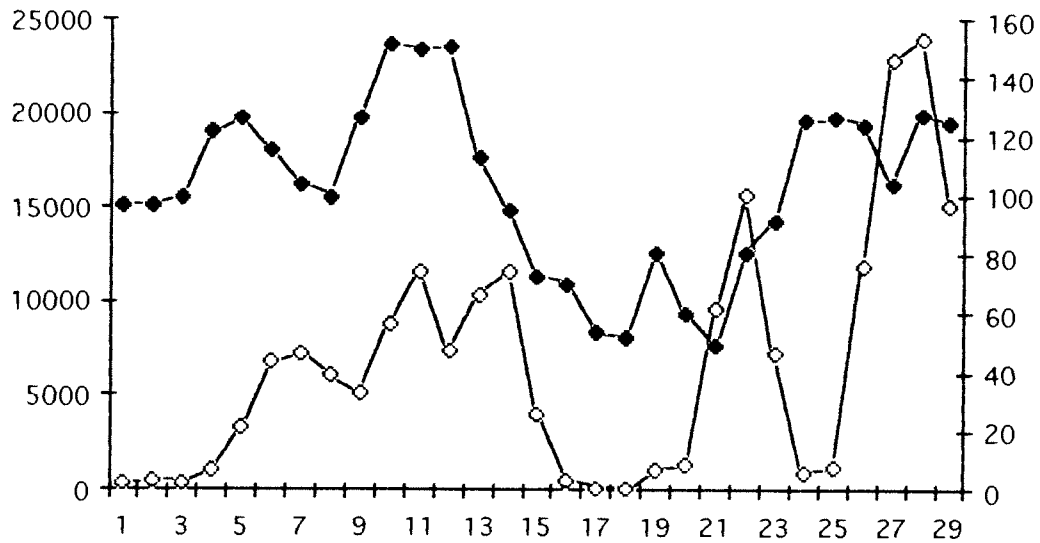
Graph 2: Capital inflows and terms of trade, 1901-1929.