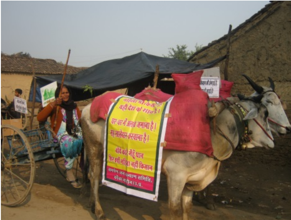
A woman farmer drives the cart with slogans of her right to land on the back of the animals. Photo taken in February 2015.

Over time, a number of civil society organizations joined the Aroh campaign, starting numerous initiatives for sole and joint land ownership of women, transfer of land in the name of women farmers, distribution of agricultural inputs, demand for work under Mahatma Gandhi National Rural Guarantee Act (MGNREGA), and access to ration cards and agricultural extension. Realizing the importance of multidimensional interventions, the Aroh Mahila Kisan Manch (AMKM) was formed in 345 villages in 71 districts of the state, comprising 7,238 women farmers. The ripples caused by the politicization of women through participation in the Aroh campaign was seen in women's increased confidence and self-esteem and their rejection of gendered positions, which we noted during the course of fieldwork in 2013–2014.