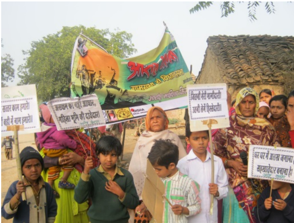
Women, children and men participated in the march to the State Legislative Assembly with their banners and placards carrying messages of women's right to land. Photo taken in March 2015.

The Aroh campaign included the following slogans: