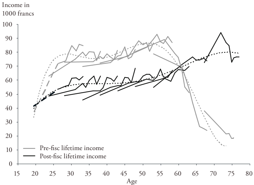
Figure 2: Average Course of Pre- and Post-Fisc Lifetime Income

Note: Each part of the curve shows the average course of income per cohort as calculated in the annual analyses for 1990, 1998, 2000–05 (for detailed figures see Table 10 in the Appendix). Strung together, these parts approximate the average course of the lifetime income before and after transfers, respectively. The dotted lines represent the smoothing of the piecewise courses. Income is calculated in 2005 prices.